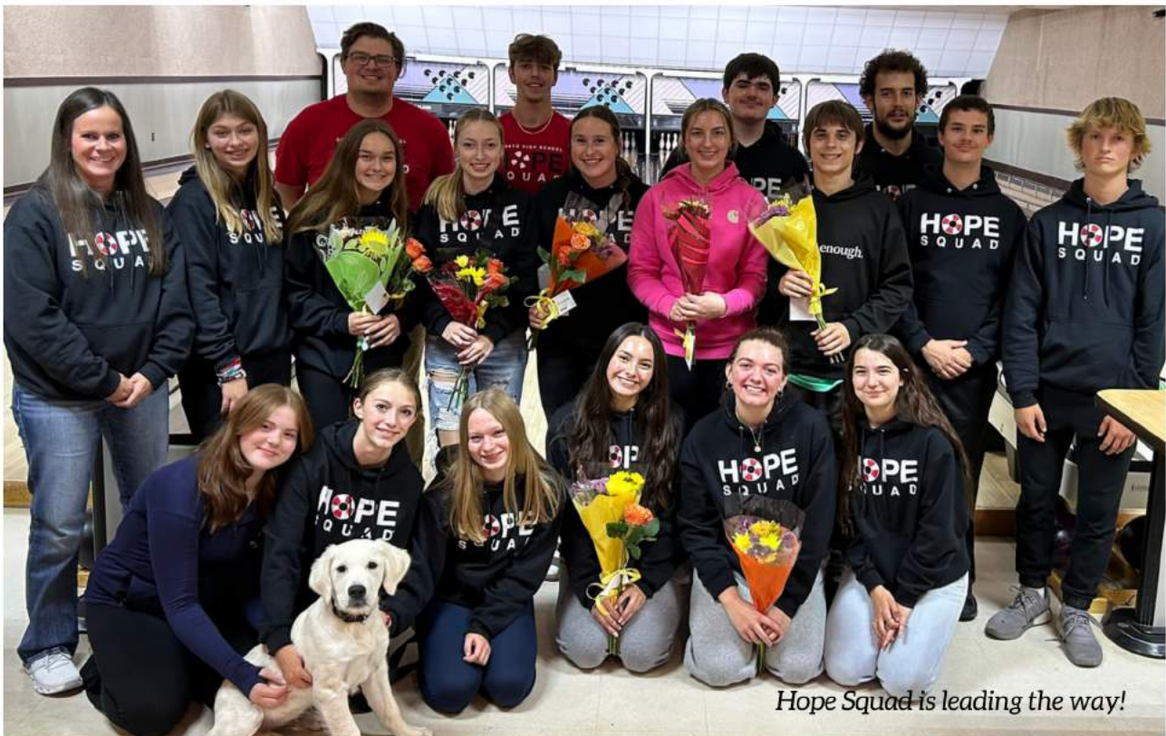
Hope Squad is leading the way!

The trio successfully fundraised $1,800 to establish a Hope Squad at a neighboring school, contributing the funds to 988, the national suicide and crisis hotline.