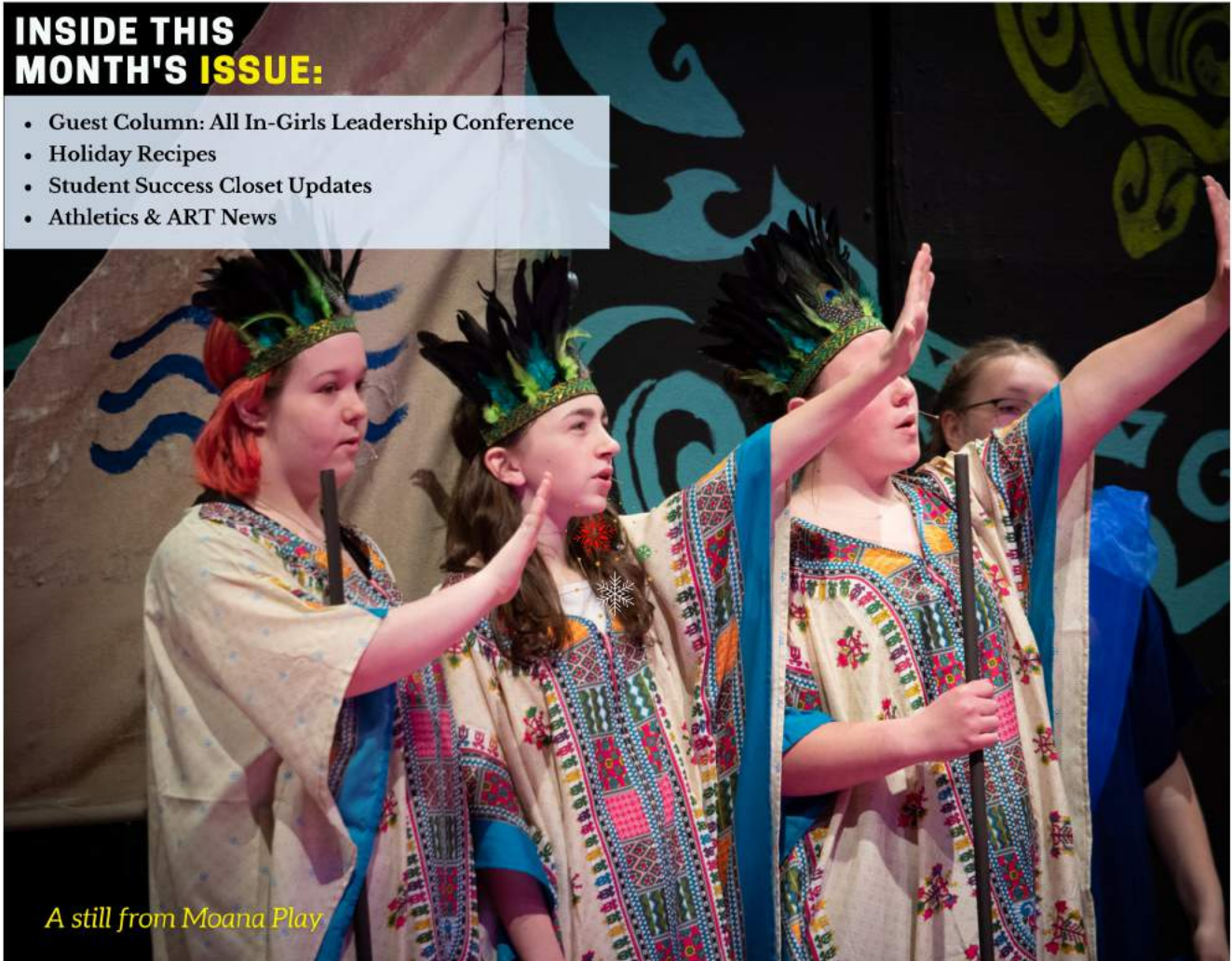
A still from Moana Play