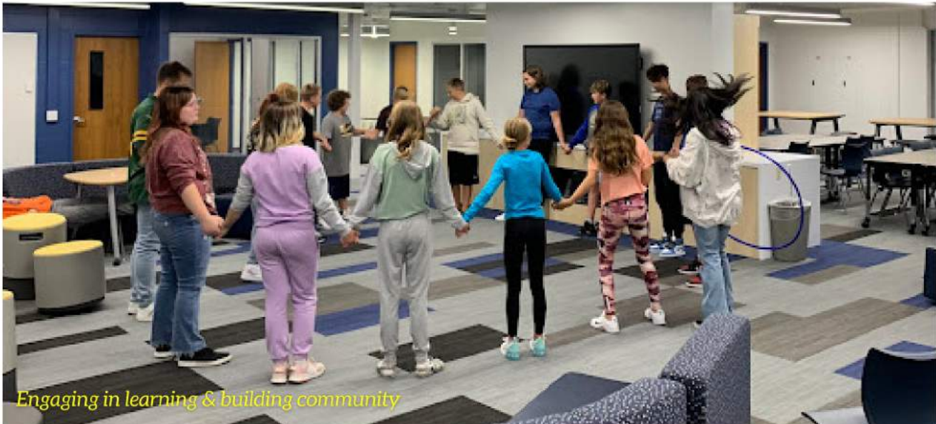
Engaging in learning & building community